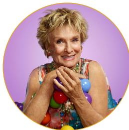
Cloris Leachman, Des Moines, IA Actress I Can Only Imagine

"Oklahoma is a surprise, it's so shockingly beautiful. It's really varied and mysterious. The sky is huge and it's kind of beautiful, spiritual."