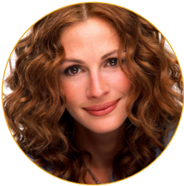
Julia Roberts, Smyrna, GA Actor August: Osage County

"We were so warmly welcomed and the location was the right one, so it goes without saying, was happy to be there."