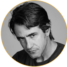
Dermot Mulroney, Alexandria, VA Actor August: Osage County

"We were so warmly welcomed and the location was the right one, so it goes without saying, was happy to be there."