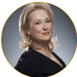
Meryl Streep, Summit, NJ Actor August: Osage County

"The people of Oklahoma are so welcoming and sweet, there's a sense of faith, family and community that you just don't see that in Los Angeles. "