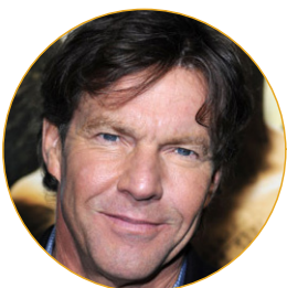
Dennis Quaid, Houston, TX Actor I Can Only Imagine

"This is my first time filming in Oklahoma and the overall experience on every level has been the absolute best. Aside from the uniquely perfect location options and production incentives, the best part of Oklahoma has been the people and especially our crew. They have been very hard working very kind professionals."