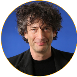
Neil Gaiman, Portchester, UK Director American Gods

“Tulsa has been, ever since I was about 19, the place in America that reeked of literary magic to me. I had plucked up the courage, and written a fan letter to R.A. Lafferty, from an address I found in the back of a book of authors in my local library...He told me how to become an author, and his advice was very good advice, and so I did. It left me quite certain that the finest literary advice in the world came from Tulsa, Oklahoma, for it did in my case. ”