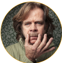
William H. Macy, Miami, FL Director Rudderless

"The general cohesiveness of the community and the willingness to embrace the film became a part of it, and Oklahoma fell in love with the film. The entire community starting with the Film + Music Office put something out there. That doesn't happen often"